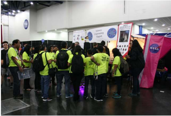
At our pit, FLL Team 16784, IvyBots - Odessa FL